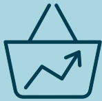
Centre Sales (Productivity)

Anchored by the city's flagship Zara and Indigo stores, Place Montréal Trust features a collection of top fashion and lifestyle brands. Located on Sainte-Catherine Street (the city's busiest commercial artery), Place Montréal Trust is directly connected to Centre Eaton de Montréal, several of the city's busiest subway stations and – come 2024 – will be the home to the downtown hub of Montréal's new light-speed rail system.