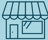
Number of Stores