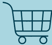
Annual Shopper Visits